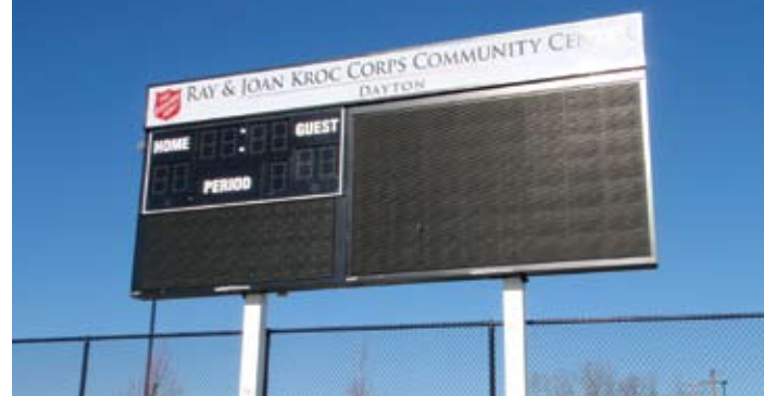
Outdoor Scoreboard at the Rec Center